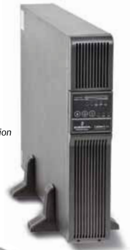
PSI 2U Tower version