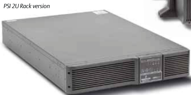
PSI 2U Rack version