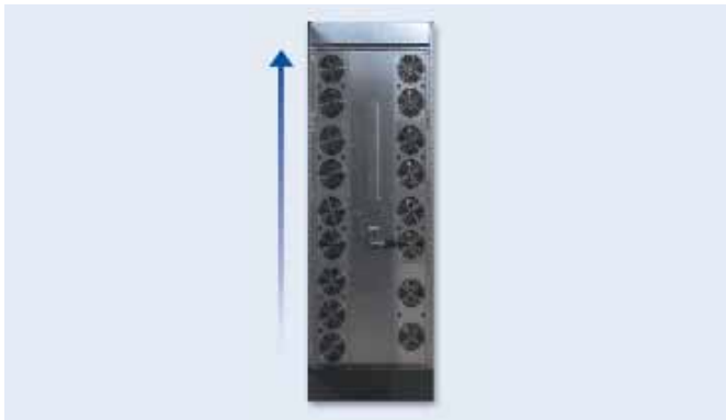
Vertical modularity: Internal view of UPS with sub-assemblies

Vertical modularity: refers to the internal architecture of the UPS in which the component parts are configured as extractable sub-assemblies inside the UPS cabinet. This improves the flexibility and serviceability of the UPS and thus reduces the time needed for service, repair (MTTR - mean time to repair minimized) and maintenance.