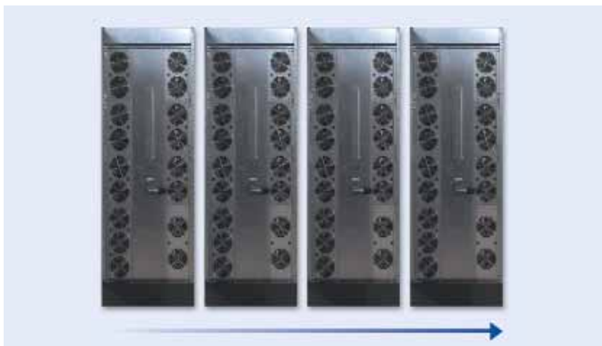
Horizontal modularity: Conventional horizontal modularity: UPS in parallel

Horizontal modularity: refers to the option of increasing the overall system power by adding additional UPS modules to an existing modular infrastructure in order to increase power and/or redundancy. Horizontal modularity allows the end user to make an initial investment in line with their immediate (short-term) power protection needs and subsequently increase the power of the system as and when their future business needs change.