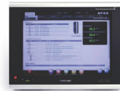
The ColdLogik RMS monitor – a professional-level unit for monitoring and managing data centre air systems. It can monitor up to 300 devices