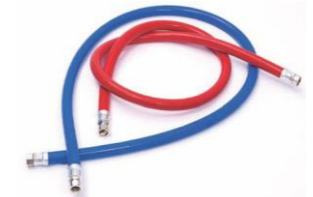
ColdLogik compliant hoses are ultra-pliable.