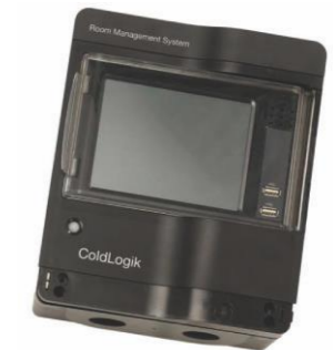
The entry level ColdLogik RMS monitor. It can monitor up to 50 devices.

It can display and log any number of the 169 parameters within each CMS unit – the number of units/plant depends on the number of parameters displayed for each, i.e. four per device = 63 units.