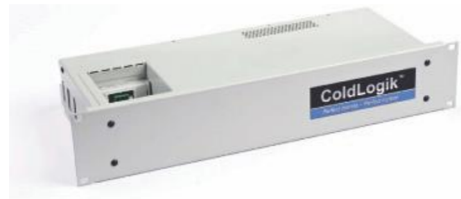
The ColdLogik Management System (CMS) unit. It lies at the heart of the ColdLogik Rear Cooler solution.

The CMS is 2U high and can be rack mounted or fitted on top of the cabinet or under floor. It ensures all variants of the ColdLogik system operate on a 'sensible cooling' principle – 'water above dew point' – and the system remaining free of condensation.