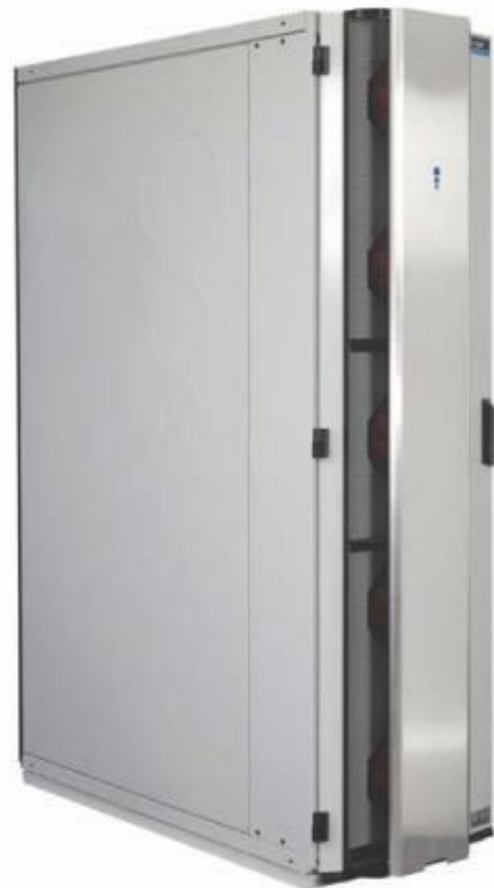
A ColdLogik Rear Cooler mounted on to a 1,200mm deep 19" USpace cabinet.

The C3 cooler is designed to work as a co-locate ColdLogik system. The set point adjustment is controlled via a commissioning tool, alarm output and BMS signalling via Modbus/CAREL/BACnet RS485 connection option..