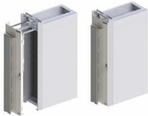
The CL20 Zero Aisle Cooler saves a huge amount of space – the door, running on caterpillar tracks at the top and wheels at the bottom, pulls out for rack access.

The runners can also be mounted to a mechanical infrastructure without fixing on top of the cabinet.