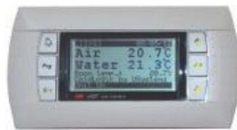
The CMS commissioning tool is used to define all the required parameters at commissioning.

The ColdLogik Management System (CMS) is configurable to suit each installation and includes these: