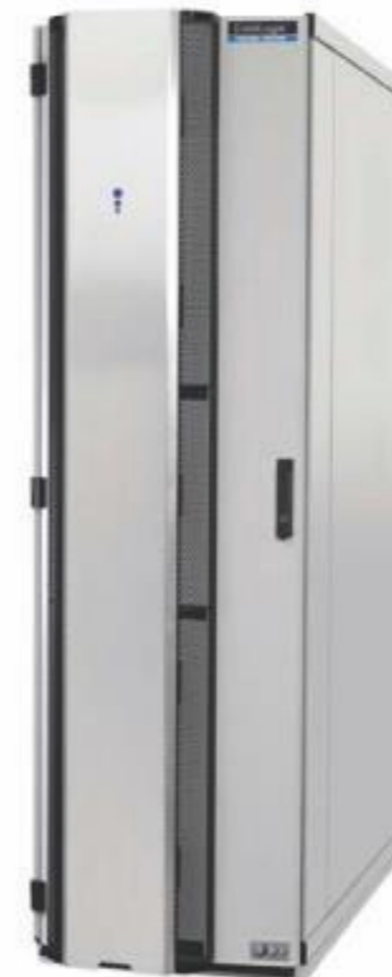
ColdLogik Rear Coolers can be run with water temperatures of 24°C

The C14sc is capable of a maximum 58kW of 'sensible' cooling and is complete with the ColdLogik Management System (CMS) – as above – and five EC fans.